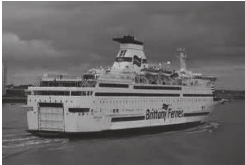
Fig. 3 for Question 3